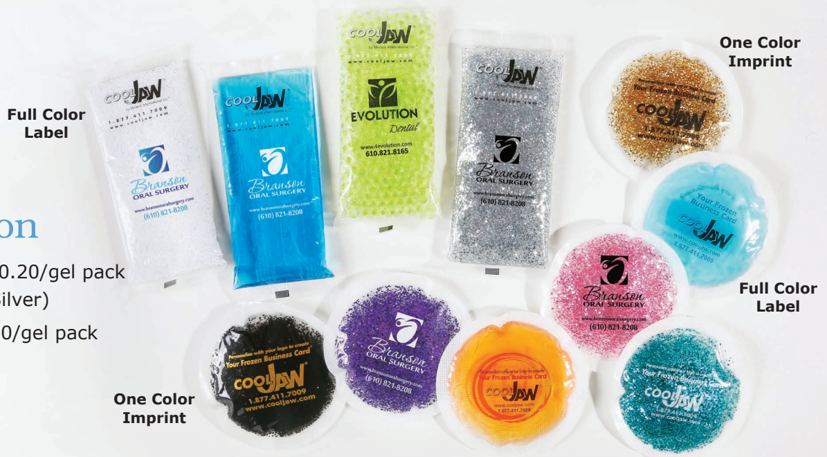
Full Color Label